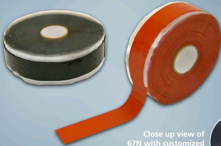
Close up view of 67N with customized perforations

Our manufacturing sites are certified ISO 9001, IATF 16949, or AS/EN 9100, ISO 14001 and ISO 45001 (Selected Sites)